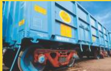
ENGINEERING & INFRASTRUCTURE